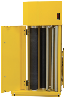
CF3 , carriage with 1-motor pre-stretch, with fixed gears. 150 or 200% Tension control from OP