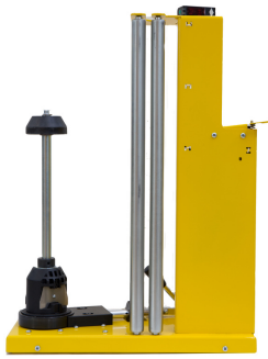
CF1 , carriage with manual core break for film tension