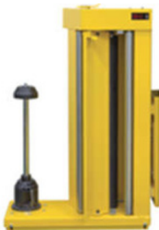
CF4 , carriage with Magnetics roll brake. OP controlled pre-stretch up to 200%