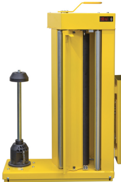
CF2 , carriage with manually adjustable single roll break for film tension