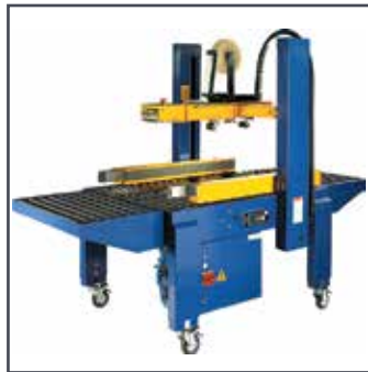
FCS-30SDR Taping Machine