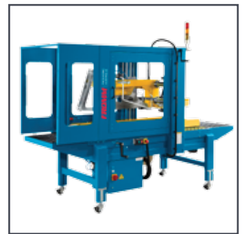
FCS-50SDF Taping Machine