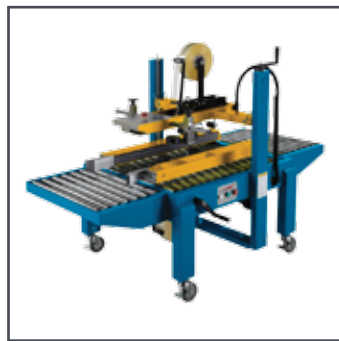
FCS-13USL Taping Machine