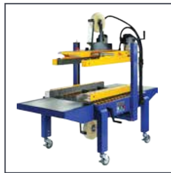
FCS-13USN Taping Machine