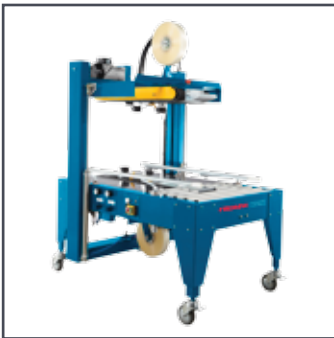
FCS-10R Taping Machine