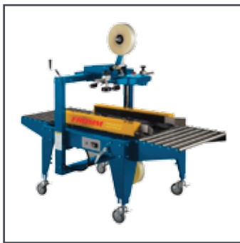
FCS-10U Taping Machine

High speed machines with options such as flap closers, stoppers to allow for orderly processing and gravity conveyors to turn your taping needs into a simple operation. Complete with Fromm standard 2 year warranty, the carton taping machines are excellent value for money.